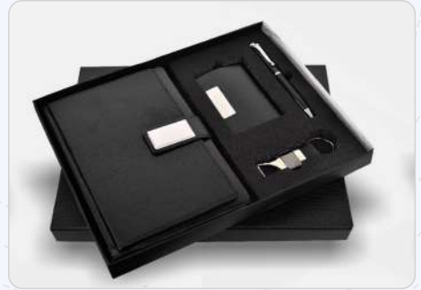
4 In 1 Set Black Diary, Pen, Keychain & Cardholder