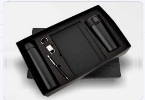
5 in 1 Black Temperature Bottle, Diary, Pen, Keychain & Vacuum Mug