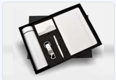
5 in 1 White Temperature Bottle, Diary, Pen, Keychain & Cardholder