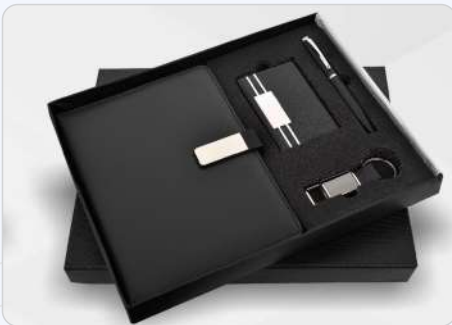
Blackwood Bottle, Diary, Keychain, Mug, Pen & Mobile Stand