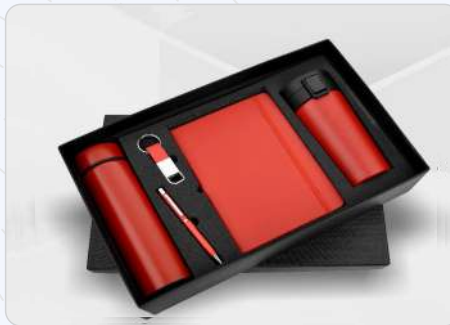
5 in 1 Red Temperature Bottle, Diary, Pen, Keychain & Vacuum Mug