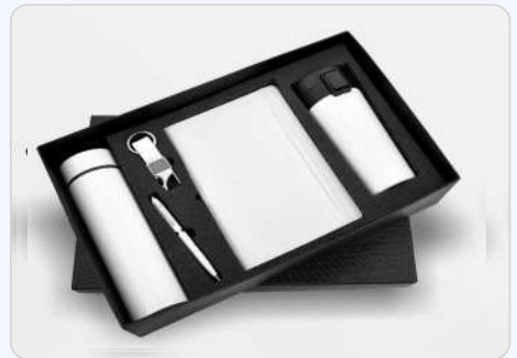
5 in 1 Black Temperature Bottle, Diary, Pen, Keychain & Vacuum Mug