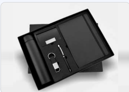
5 in 1 Black Temperature Bottle, Diary, Pen, Keychain & Cardholder