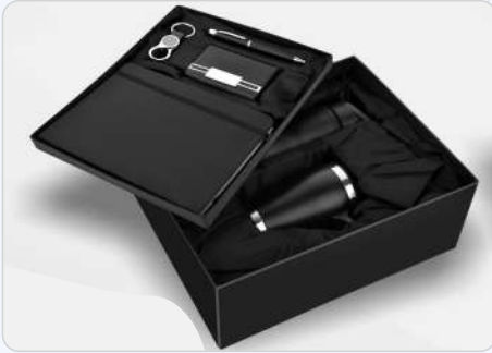
6 In 1 Employee Kit Diary, Pen, Keychain, Cardholder, Mug & Bottle