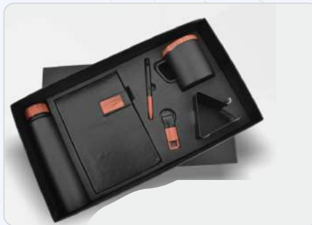
4 In 1 Set Black Diary, Pen, Keychain & Cardholder