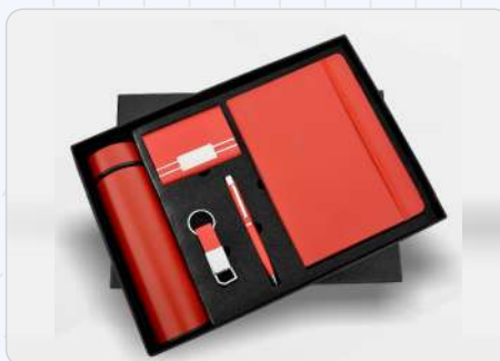
5 in 1 Red Temperature Bottle, Diary, Pen, Keychain & Cardholder