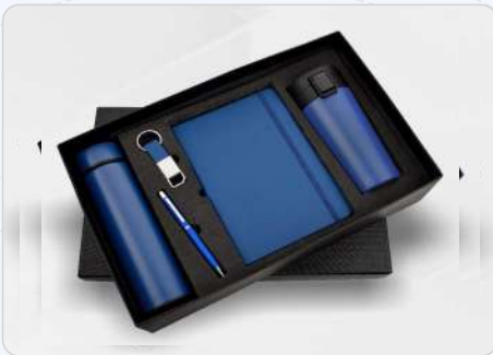
5 in 1 Blue Temperature Bottle, Diary, Pen, Keychain & Vacuum Mug