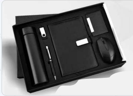
6 In 1 Wireless Mouse, Cardholder, Diary, Pen, 16 Gb Pen Drive