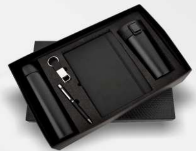
5 in 1 Black Temperature Bottle, Diary, Pen, Keychain & Vacuum Mug