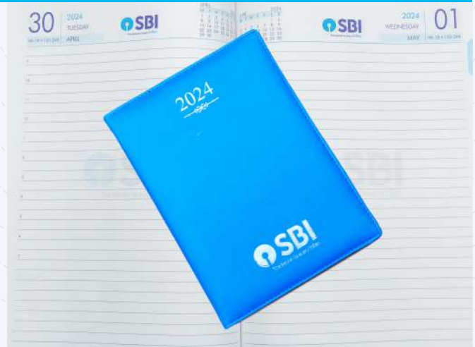
SBI DIARY N/S SOFT BLUE (BIG SIZE)