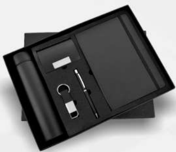
5 in 1 Black Temperature Bottle, Diary, Pen, Keychain & Cardholder