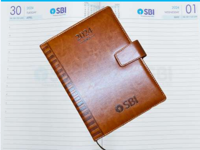
SBI DIARY N/S SOFT (CHANGER LOOP ) BIG SIZE