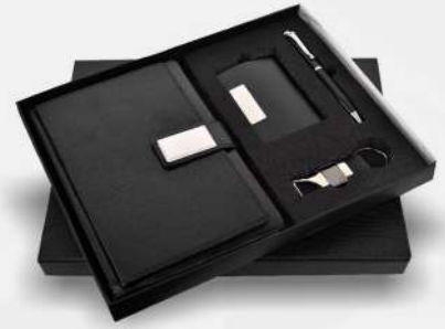
4 In 1 Set Black Diary, Pen, Keychain & Cardholder