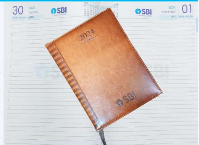
SBI DIARY N/S SOFT (CHANGER) BIG SIZE