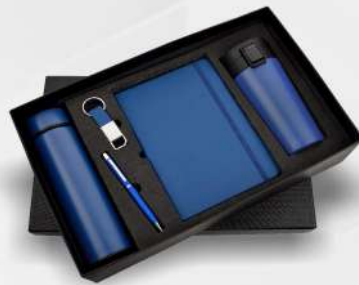
5 in 1 Blue Temperature Bottle, Diary, Pen, Keychain & Vacuum Mug