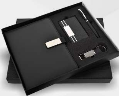
Blackwood Bottle, Diary, Keychain, Mug, Pen & Mobile Stand