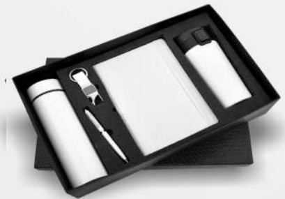
5 in 1 Black Temperature Bottle, Diary, Pen, Keychain & Vacuum Mug