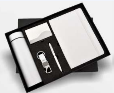
5 in 1 White Temperature Bottle, Diary, Pen, Keychain & Cardholder