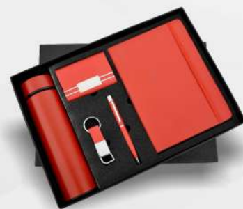
5 in 1 Red Temperature Bottle, Diary, Pen, Keychain & Cardholder