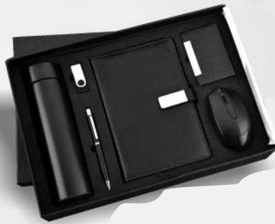
6 In 1 Wireless Mouse, Cardholder, Diary, Pen, 16 Gb Pen Drive