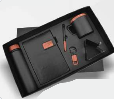
4 In 1 Set Black Diary, Pen, Keychain & Cardholder