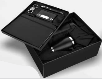
6 In 1 Employee Kit Diary, Pen, Keychain, Cardholder, Mug & Bottle