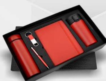
5 in 1 Red Temperature Bottle, Diary, Pen, Keychain & Vacuum Mug