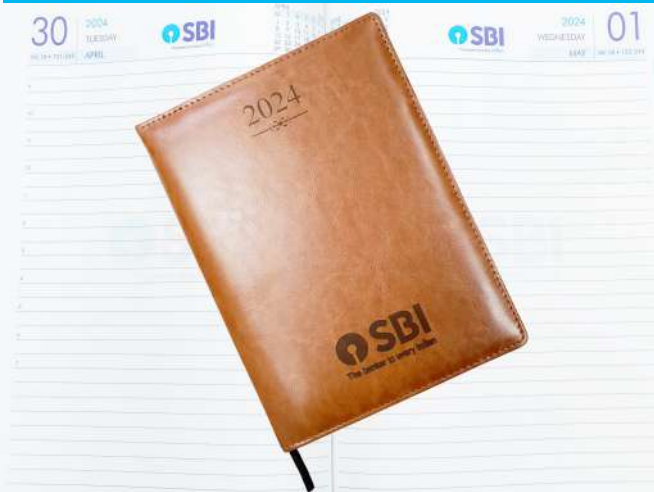
SBI DIARY N/S SOFT (BIG SIZE)